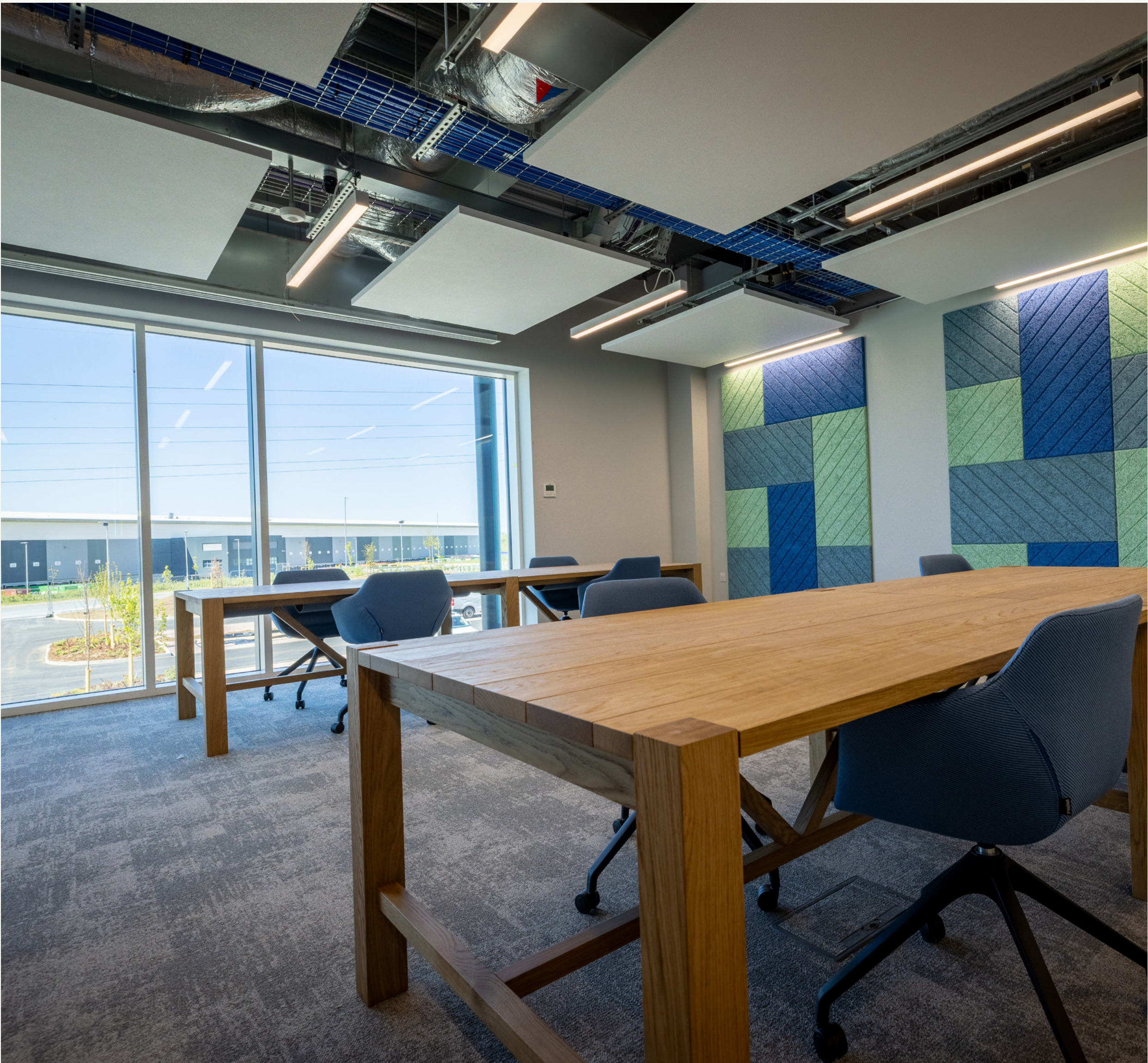
The space demonstrates how sustainable design, flexible workplaces and educational facilities can work together to support innovation, skills development and economic growth.